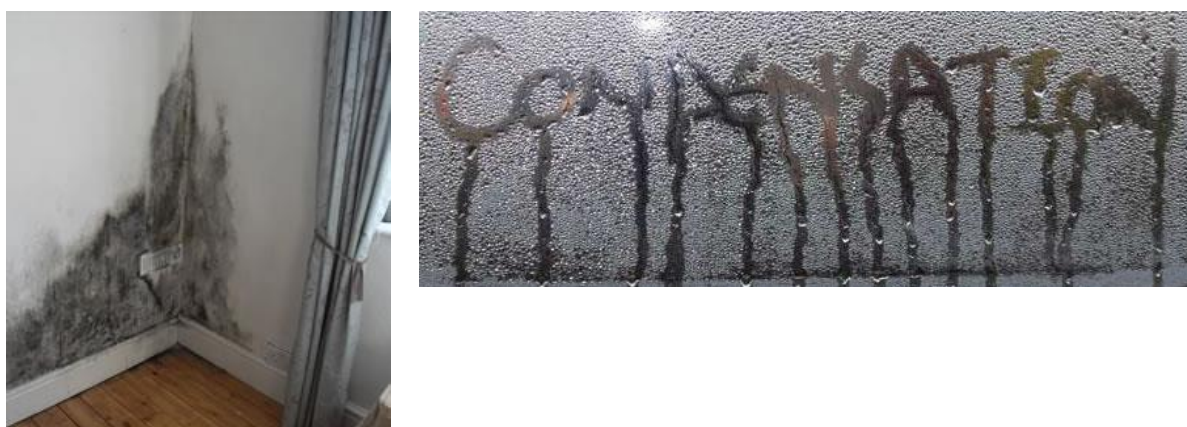
Figure 2: Examples of mould and condensation

The Energy Performance Certificate will include information on the insulation levels of the property but when you visit the property you should check that the windows shut properly and whether the property is draughty. These will have an impact on how much it costs to heat the property so again, if there are problems, ask the landlord to fix them before you move in.